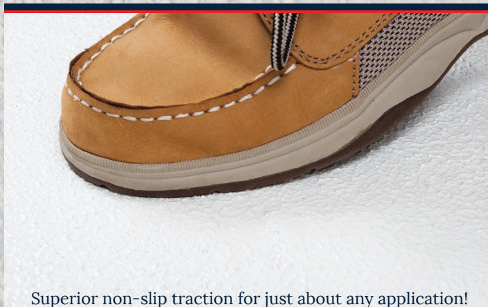
Superior non-slip traction for just about any application!