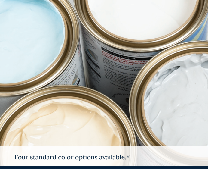
Four standard color options available.*