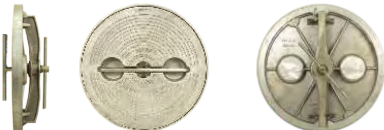
BFHRTTH20A/S with Galvanized Steel Deck Ring