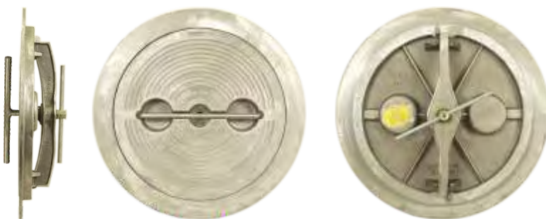
BFHRTTH20A/A with Cast Aluminum Deck Ring